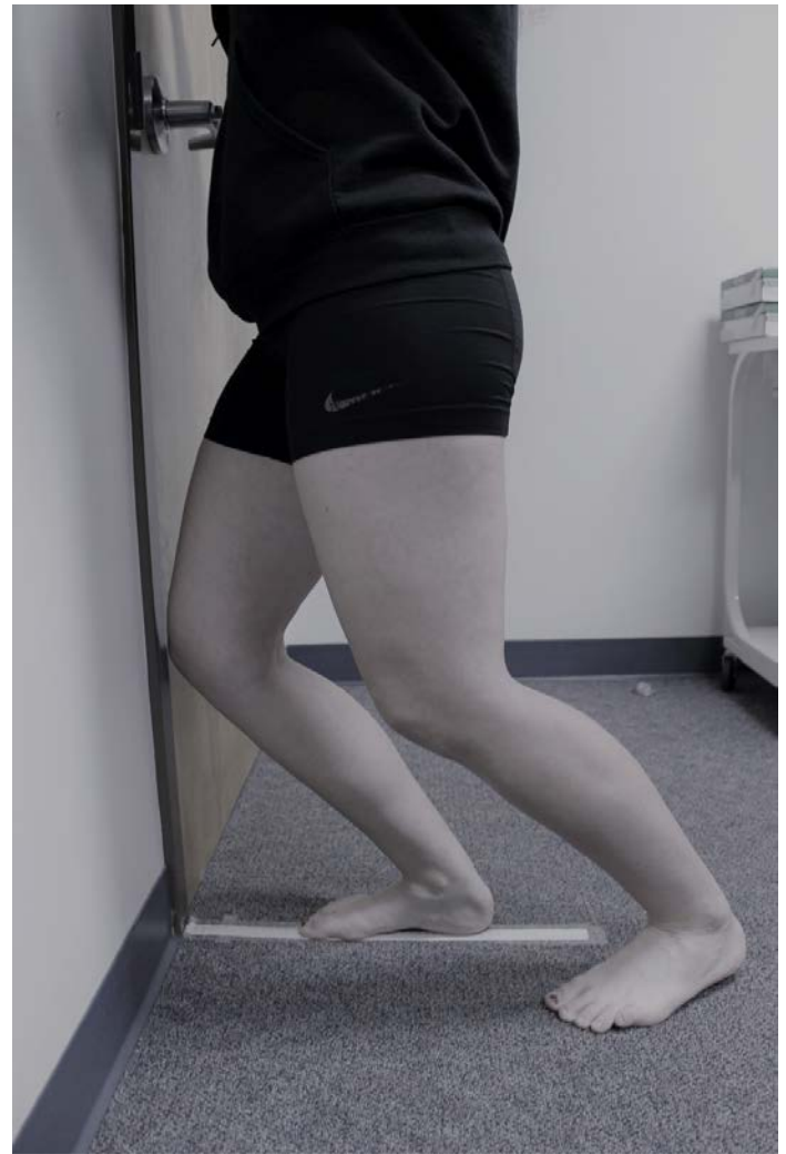
Figure 2. The Weight-Bearing Lunge Test

The WBLT is a test used to measure passive ankle dorsiflexion range of motion in the weight-bearing posture. The WBLT has strong test-retest reliability for participants with ankle dysfunction. 24,25 Previous research has identified that WBLT minimal detectable change using the test was 1 cm for the affected limb and 1.5 cm for control limbs with no reported pathology. 25 Participant were provided verbal instructions and demonstration from the researcher on how to perform the test using the knee-to-wall method (Figure 2) used in previous research. 26-28 Participants were placed in front of the designated doorframe where they were asked to place their testing foot on the tape measure 5 cm away from doorframe to start test and then informed to lunge towards the doorframe, and aim to hit their knee on the frame. 29 The participant was not allowed to lift their heel off the floor or move their foot closer to the doorframe. If the participant was able to complete this, then their foot was moved further back on the tape measure until they were no longer able to reach frame or lift their heel. At that time, the distance was recorded for the participant. These steps were repeated three times and averaged together to determine the mean WBLT measure per limb.