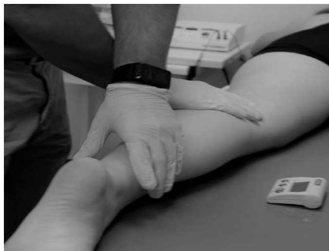
Figure 1. Application of the DOT intervention to the lower-leg

The research team was trained in proper application of the DOT modality from the manufacturer representatives. Prior to the intervention, the participant's area of treatment and hand that held the lead from the DOT modality were dried. The treatment was conducted on an examination table that had no direct contact with metal from the researcher or the participant.