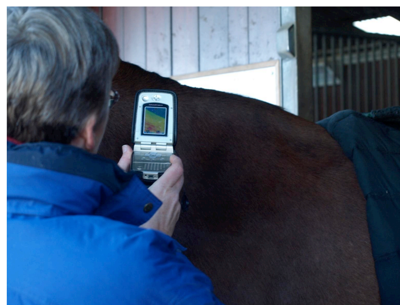
Figure 3 – Infra red thermographic image being taken