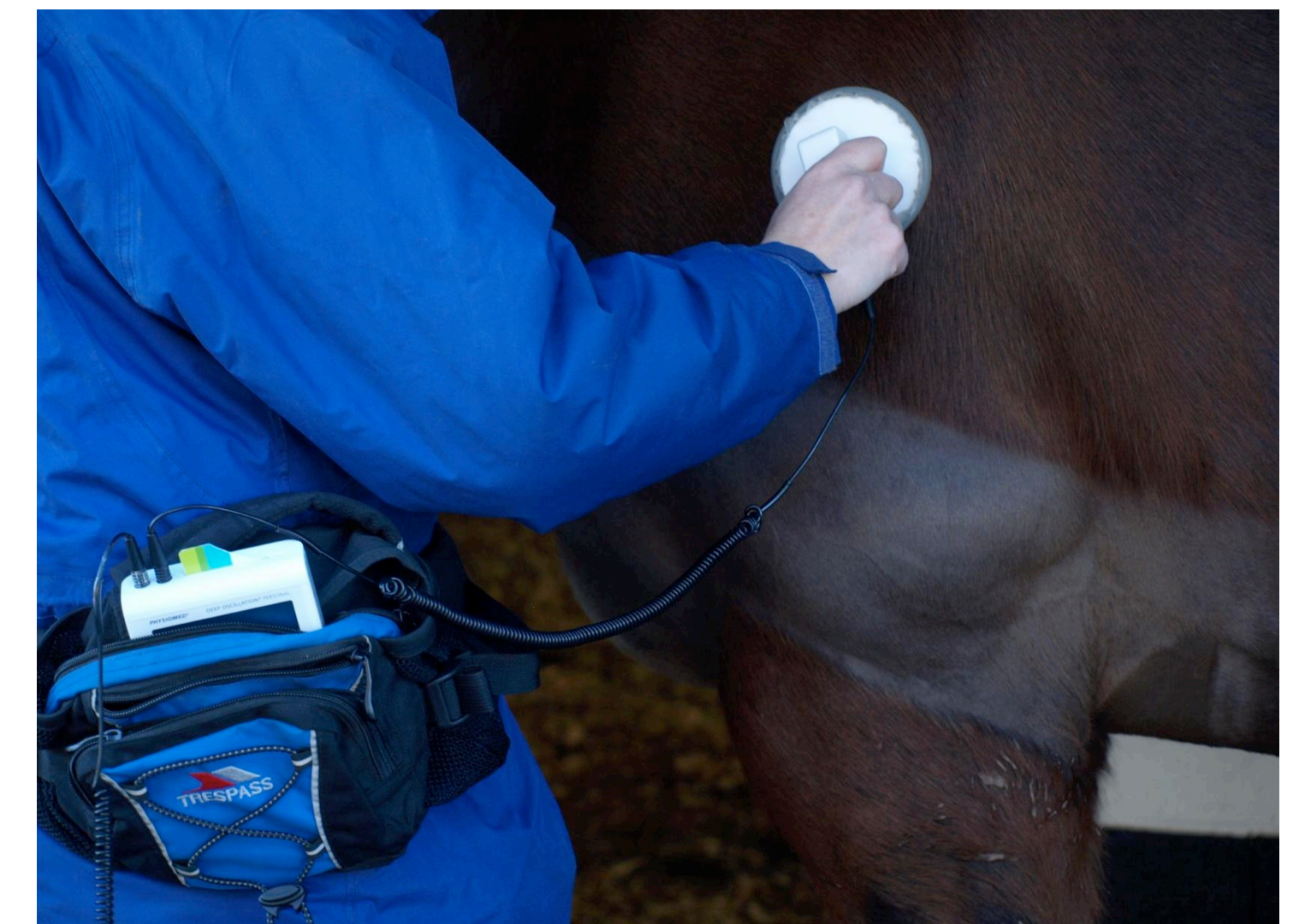
Figure 2 – Deep oscillation being applied to area 3

Yard staff at Brackenhurst Equestrian Centre at the University and Physiopod for the loan of the deep oscillation equipment and a contribution to the study.