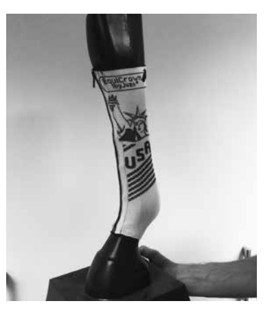
Even animals can suffer from lymphoedema – this is a specially made product for a horse.