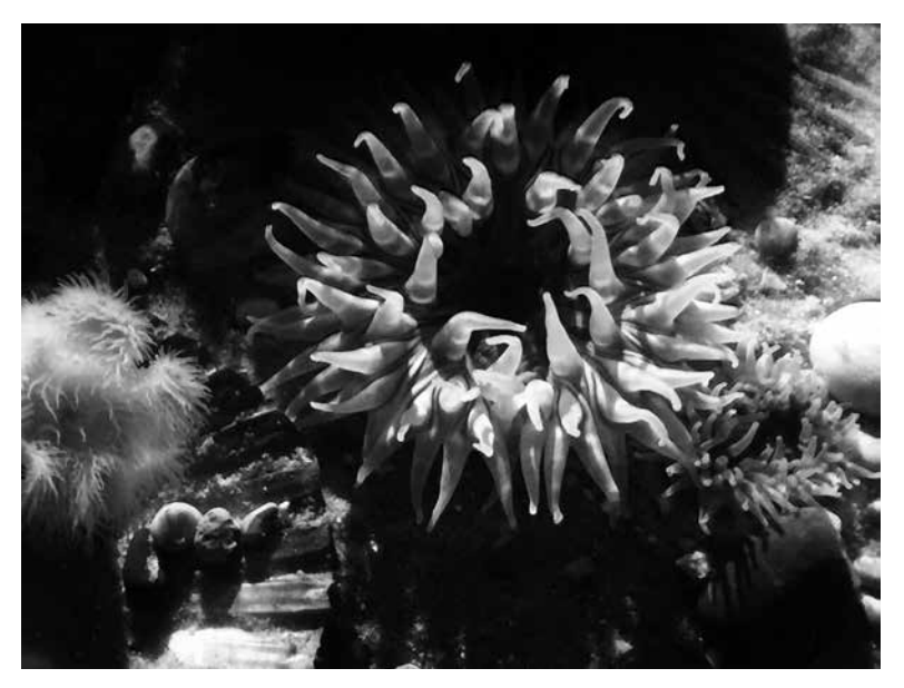
The smallest lymph vessels, which absorb fluid from the tissues, are tubes that resemble the tentacles on sea anemones.

Lymph glands perform two basic functions: they clean up the lymph before it re-enters the bloodstream, by sieving out, trapping and destroying foreign materials; and they monitor the lymph for telltale signs of infection in the body, playing a vital role in our immune system.