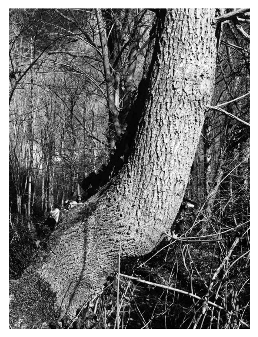
In longstanding lymphoedema the skin can become so thick that it can look and feel like the bark on a tree.

'elephantiasis', which is sometimes used instead of lymphoedema, comes from this change in complexion of the skin and the fact that the swollen leg could be said to resemble that of an elephant.