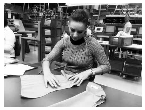
Every made-tomeasure (and standard) garment is hand checked several times.