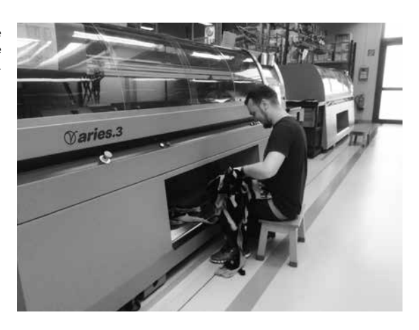
A made-to-measure garment coming off the knitting machine.