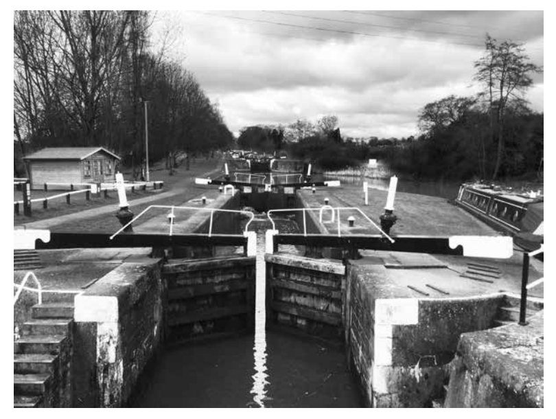
The valves within lymph vessels work like canal lock gates, ensuring lymph can only flow in one direction.