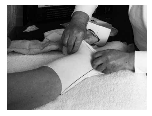
Preparing the hand and arm for compression bandaging with a soft cotton bandage to protect the skin, for a patient who developed lymphoedema after an episode of cellulitis caused by a cat's bite.