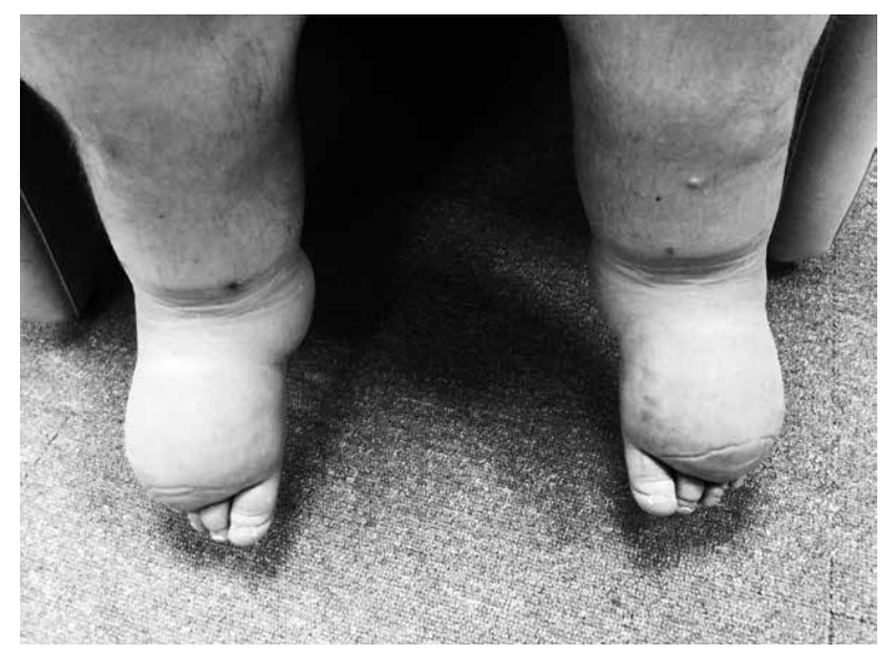
Foot swelling such as this is not only uncomfortable, making it very difficult to find shoes that fit, but also makes walking more difficult.

Her swollen limbs are disfiguring and attract unwelcome looks and unkind comments from other children and adults. And she struggles to find clothes and shoes that fit. Here is her story: