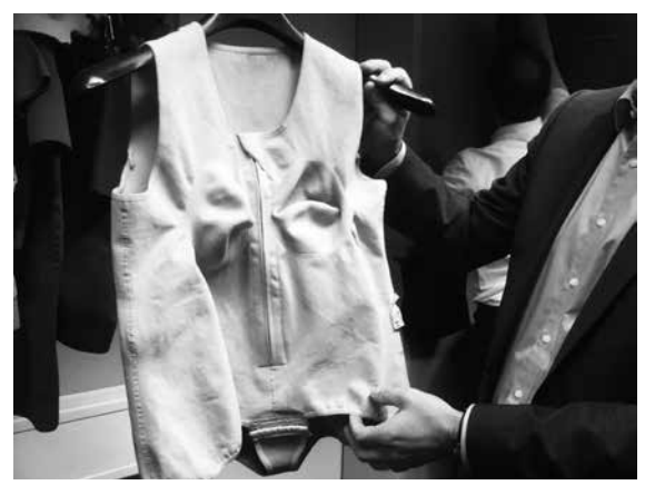
A body/thorax compression garment with integral breast cup undergoing tests in the garment testing room.