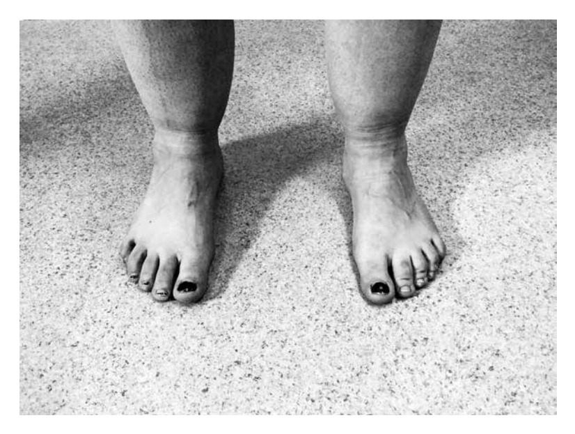
A 'fat' ankle or 'cankle' is characteristic of lipoedema. Extra fat builds up in the lower leg immediately above the ankle bones, while the rest of the foot remains normal.

still thin except for my legs. After reading an article in a national newspaper on lipoedema I made an appointment to see my GP. Unfortunately, I had to go back several times before I was referred to a specialist, as they had never even heard of the condition. But eventually I was referred on to a doctor who confirmed that yes I did have lipoedema. What a relief! I had a reason for my 'tree trunk' legs and I wasn't fat!