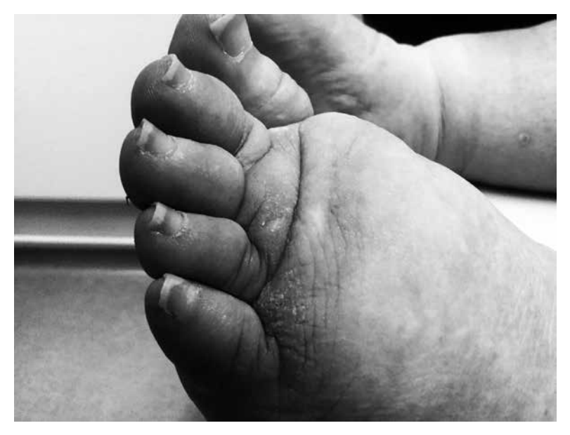
Poor mobility and long periods spent sitting can make lymphoedema worse. The skin soon becomes thicker with cracks and crevices that harbour germs, increasing the risk of infection.