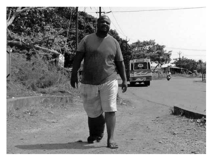
A man suffering from filariasis, which is also known as elephantiasis because the swollen leg resembles that of an elephant.