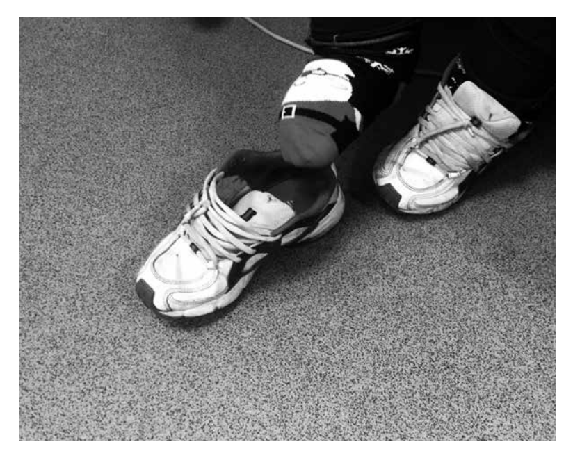
A swollen foot causes immense problems with footwear. The shape of the shoe is often stretched and distorted, which in turn reduces the shoe's support function, making a normal gait more difficult, and further affecting lymph drainage.

wider or swollen feet. These specialist footwear outlets can be accessed in the UK through the patients' organisation the Lymphoedema Support Network.