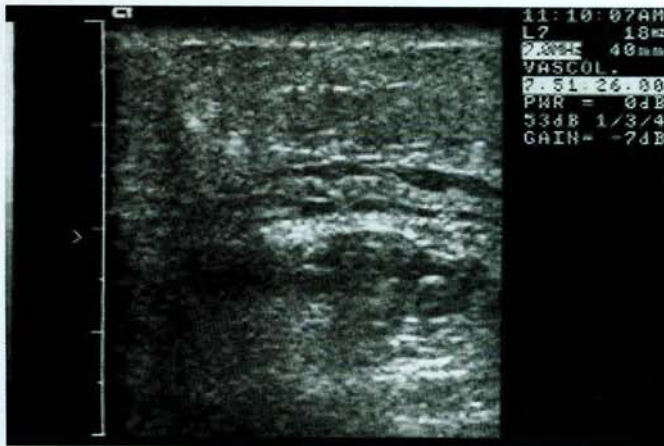
Photo 1. Ecographic window of a limb with lymphedema with evident connectivization and presence of lymphatic lakes.